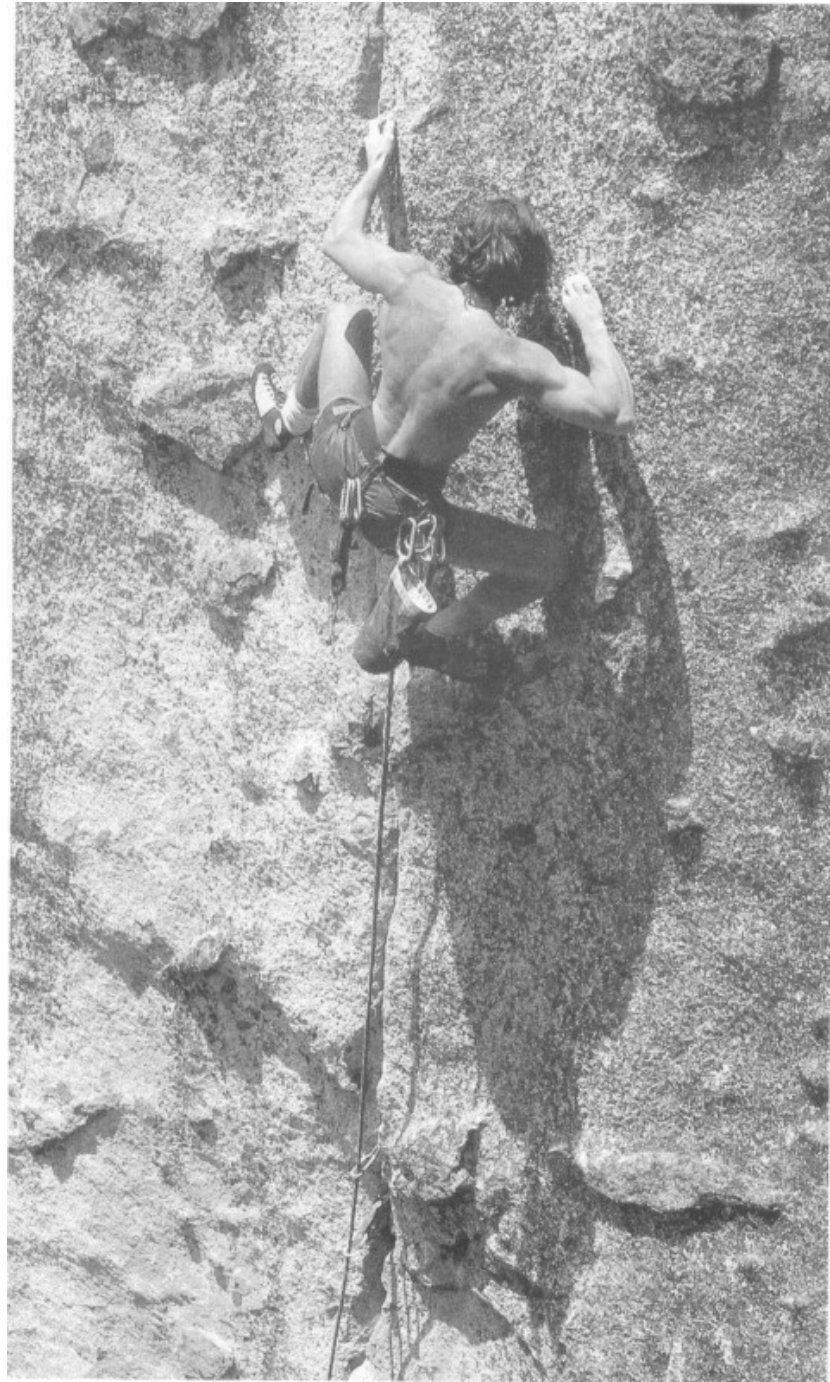
Photo, previously posted by Walleye, from p.40 of Gullich's book Sportklettern Heute

http://www.supertopo.com/climbing/thread.html?topic_id=375380&tn=80