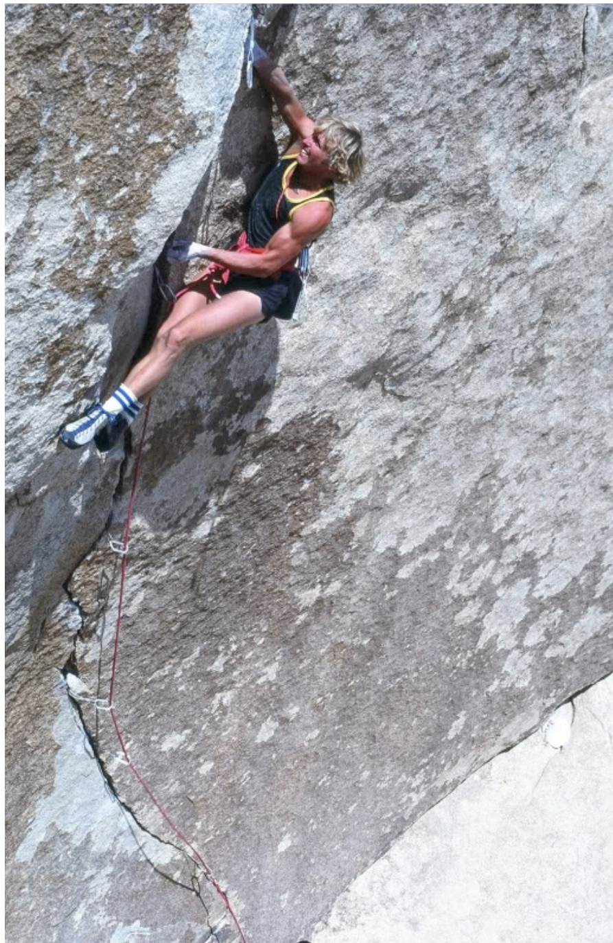
First Lead of Acid Crack, Joshua Tree